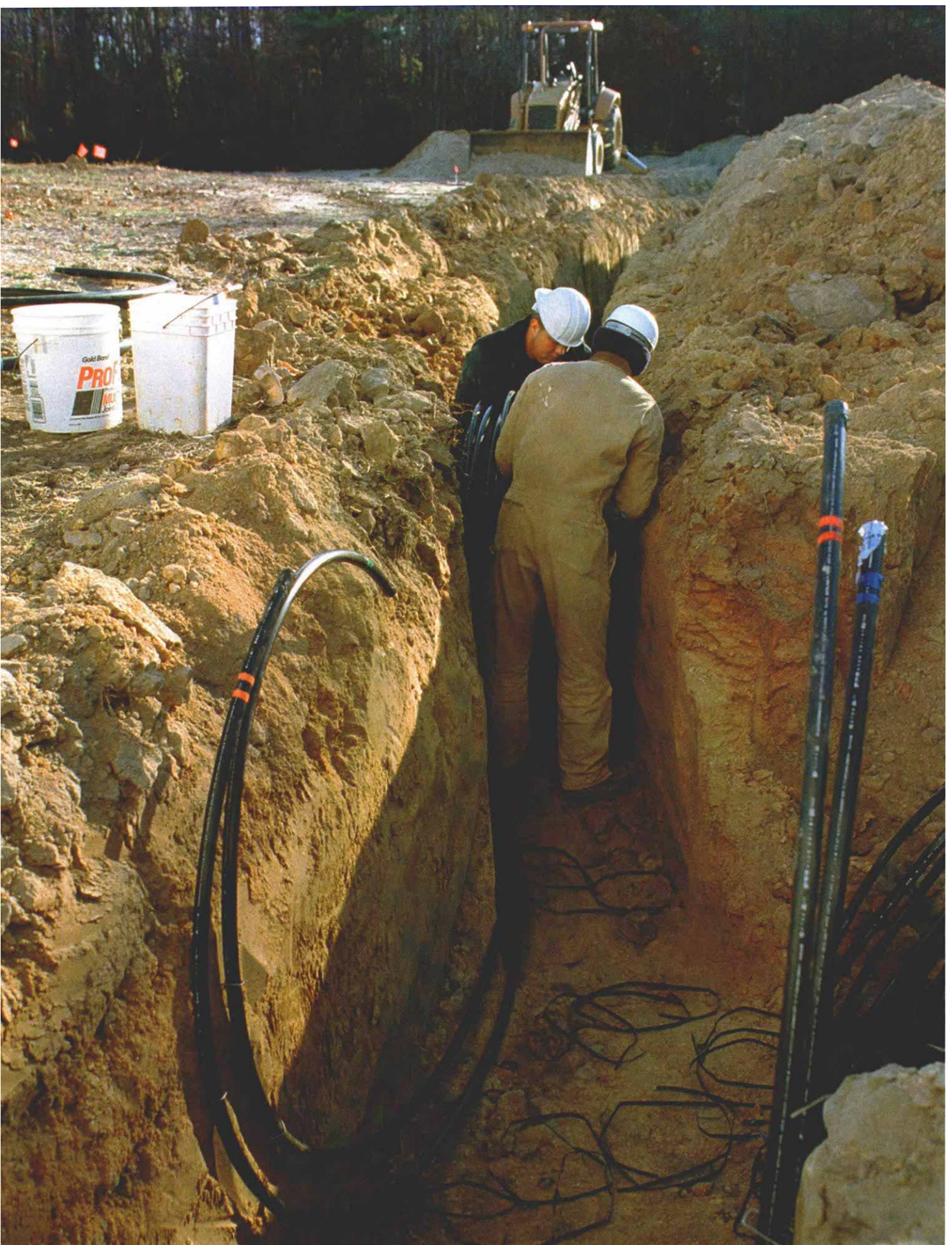
Heart of the system is underground. After coils of tubing have been pressure-tested, they are rolled into a waiting trench. Note that the shoulders of the trench have been stepped back to minimize the threat of a collapse.