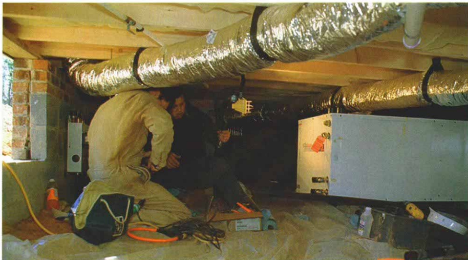
Heat pumps can live virtually anywhere. Even a crawlspace with crouch-only headroom is large enough for this style of heat pump. Other models stand upright. Supply and return ducts are insulated.

Before any excavation begins, we measure and mark off the area for trenching, and we always contact local utilities for information on buried gas, water and electric lines. In this installation, we were lucky. There was plenty of room behind the house for the trenches. I decided to go with two separate trenches that are parallel for about half their length. As I neared the tree line, I turned the trenches back toward the house, so from the air,