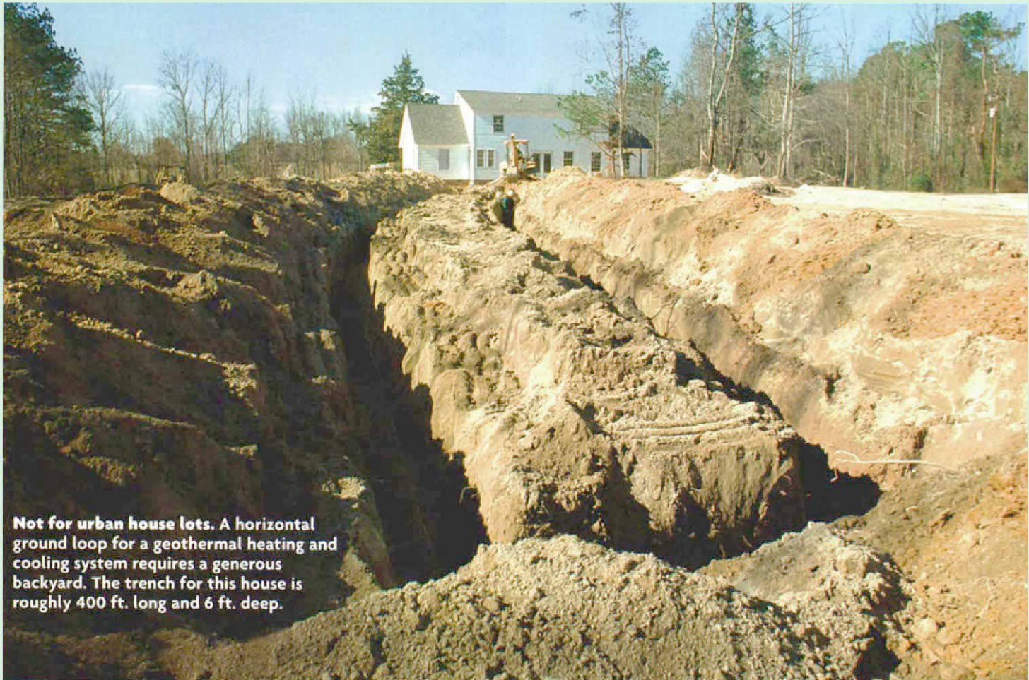
Not for urban house lots. A horizontal ground loop for a geothermal heating and cooling system requires a generous backyard. The trench for this house is roughly 400 ft. long and 6 ft. deep.

B ack in the early 1980s, my mechanical-contracting business installed air-to-air heat pumps and gas furnaces. Period. Then I started designing a new house for myself. I oriented the house for passive-solar heat, chose premium windows and doors, and after some intensive research, settled on a geothermal heat pump to heat and cool the house. It was the clear first choice.