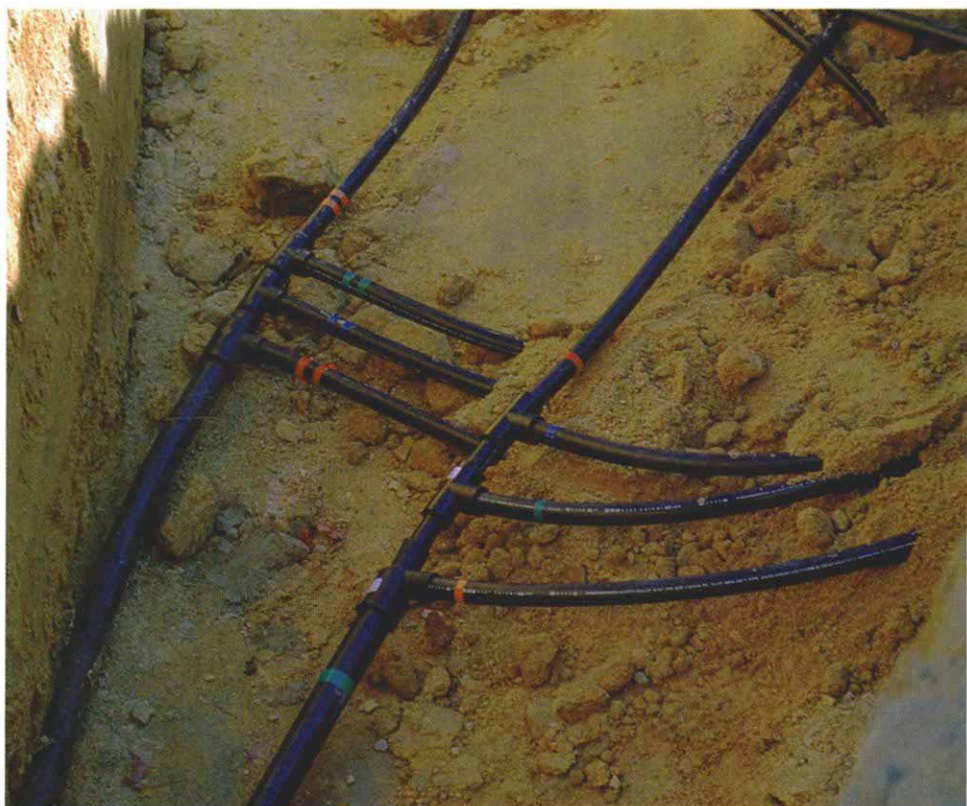
Color-coding keeps loops straight. Manifolds divide the single supply and return lines into four separate circuits. Colored vinyl tape identifies each circuit, two stripes for supply and a single stripe for return.