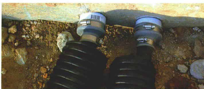
Sealing foundation against leaks. Where supply and return lines penetrate the foundation, the author uses plastic sleeves and boots to seal out water. Corrugated plastic drain line protects the water loop from damage.