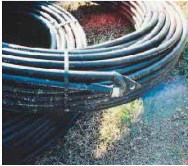
Figure 6. This polyethylene pipe has been prepared for lowering into a bore hole for a vertical ground loop. The U-fitting will sit in the bottom of the bore hole.