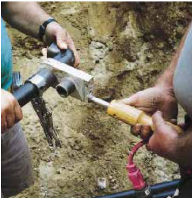
Figure 7. Heat-fusion joining is used to make joints in the polyethylene pipe of a closed-loop ground-source heat pump. When properly made, such joints are said to be stronger than the pipe itself.

Make communication between subcontractors a high priority. In some