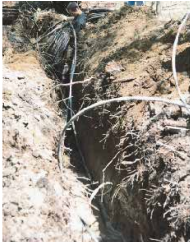
Figure 2. After a backhoe digs a 5-foot-deep trench, two parallel polyethylene pipes are laid for one section of a horizontal ground loop.