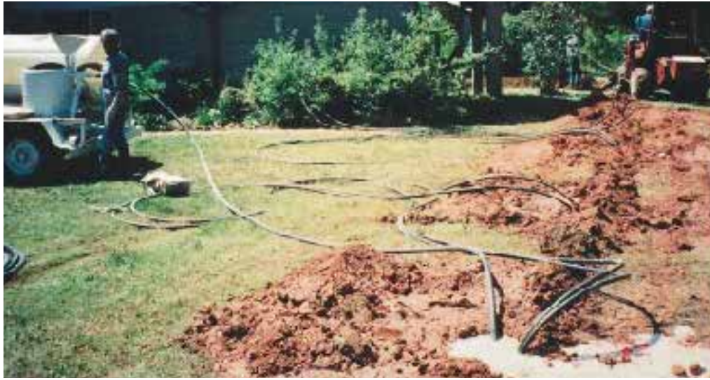
Figure 4. Each of the four bore holes for this vertical loop installation was grouted after the pipes were installed. The grout improves the thermal conductivity between the soil and the loop.

Connection method. Any underground connections must be heat-fused — never glued or mechanically fastened (Figure 7, next page). Pipe connections should be pressure-tested before backfilling.