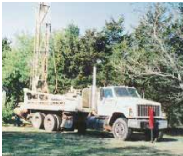
Figure 3. A well driller prepares to dig the bore holes for a vertical ground loop. On this job there were four 200-foot bore holes, each containing 400 feet of polyethylene pipe.

Pipe diameter is critical to proper loop design, and must be calculated by a qualified designer. Substituting a smaller or larger pipe diameter can lead to poor performance (Figure 6, page 5).