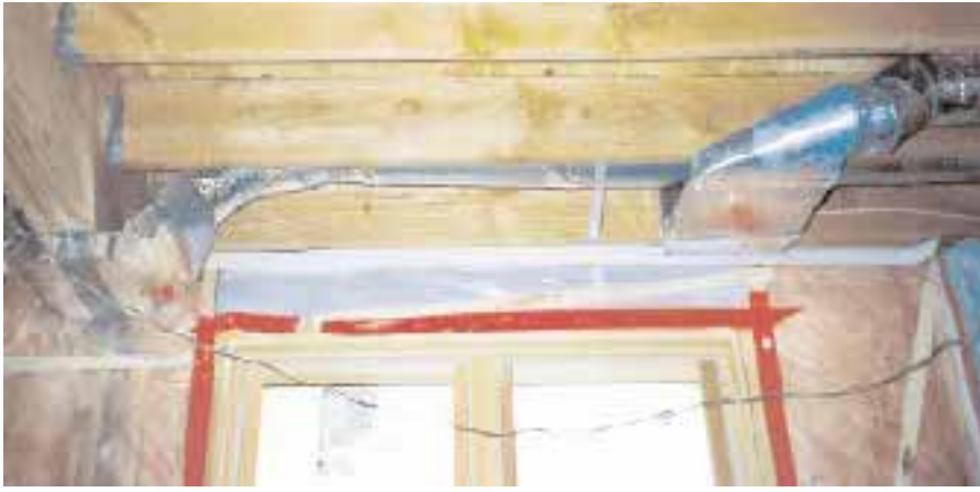
Figure 8. This branch duct jumps under a beam and across a joist bay, creating friction losses and reducing air flow. Plan the location of duct runs before framing begins, to avoid complicated ducts like this one.

heat pump installations, up to four different subcontractors are involved (the excavator, the well driller, the electrician, and the hvac contractor). With this many subs, there are plenty of opportunities for miscommunication.