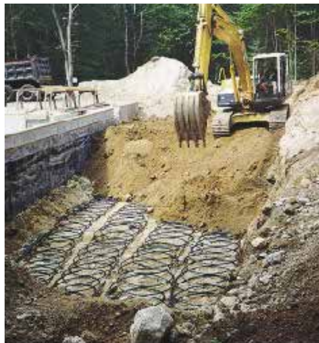
Figure 5. This closed-loop system uses “slinky” coils, installed horizontally in a wide excavation. The ground loop is being backfilled with clean material.

Two-well systems pump water from one well through the heat pump, then back into another nearby well. There